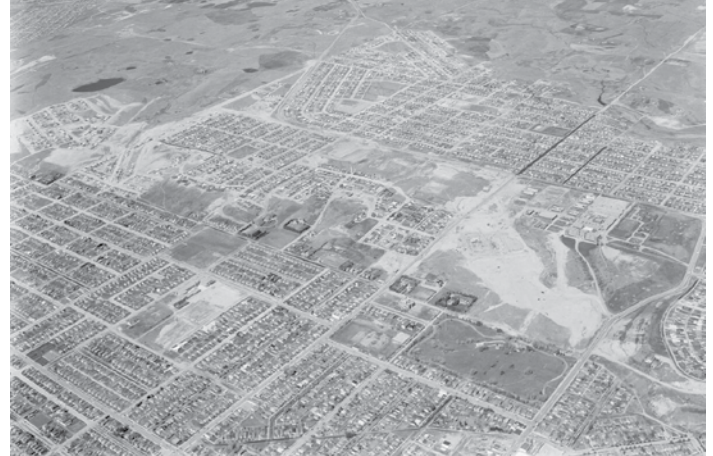
Aerial view of northwest Calgary, 1957