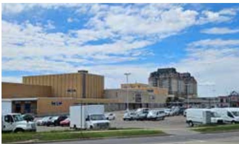
North Hill Centre, 2023 (Anthony Imbrogno)