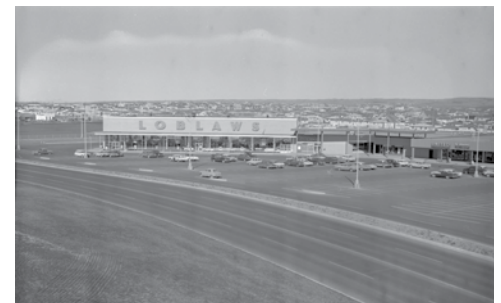
View of North Hill Shopping Centre, 1960