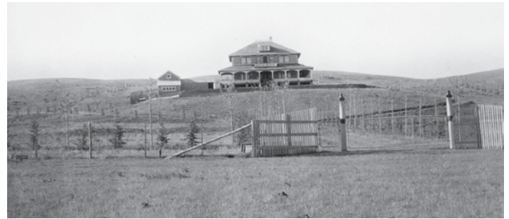
Hounsfield Lodge, 1905-1906