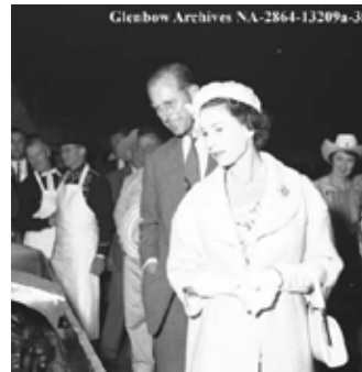
Visit of Queen Elizabeth II and Prince Philip in 1959, Calgary Herald. The visit included a tour of Britannia. The Queen was pregnant with Prince Andrew.