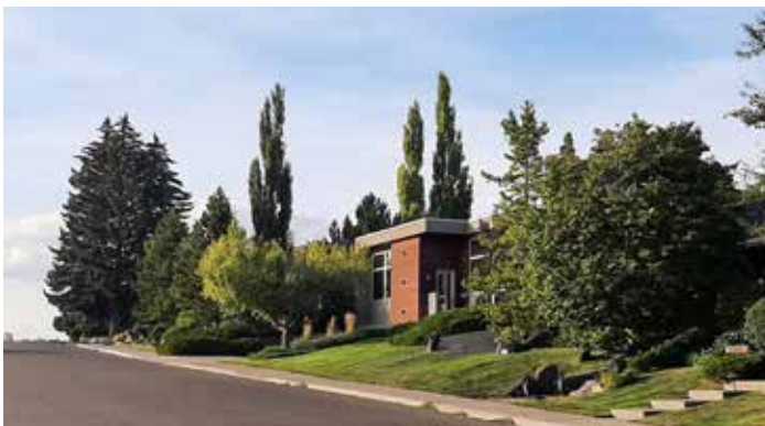
Britannia Dr 2022 (CHI)