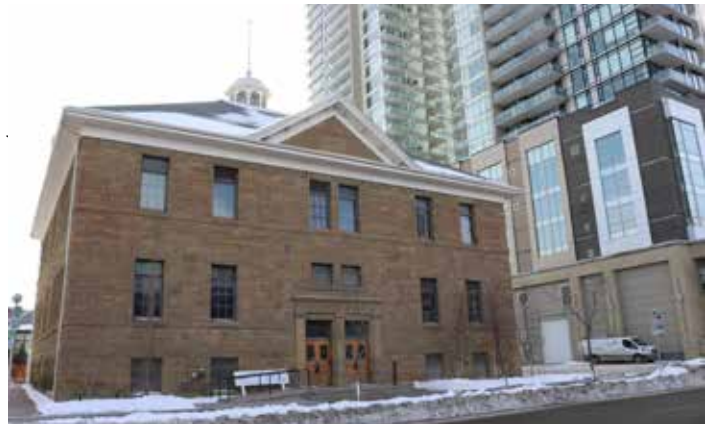
Victoria Sandstone School 411 11 Ave SE (CHI Dec 2020)