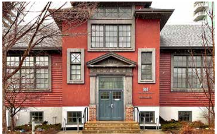
Victoria Bungalow School 456 12 Av SE (CHI Ap 2022)