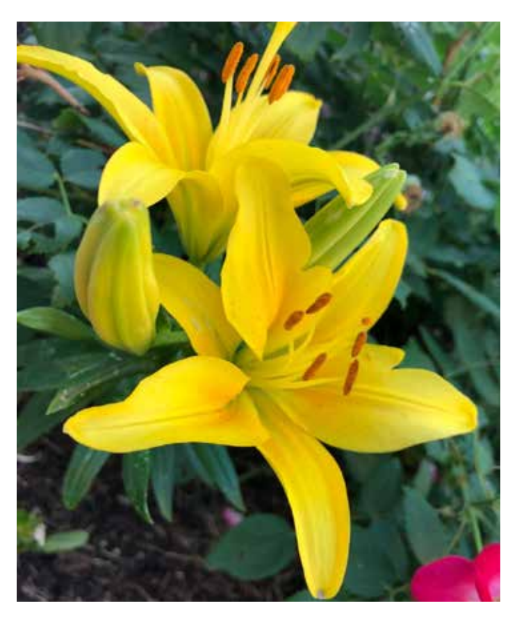
Flower By Yashu Mattapalli