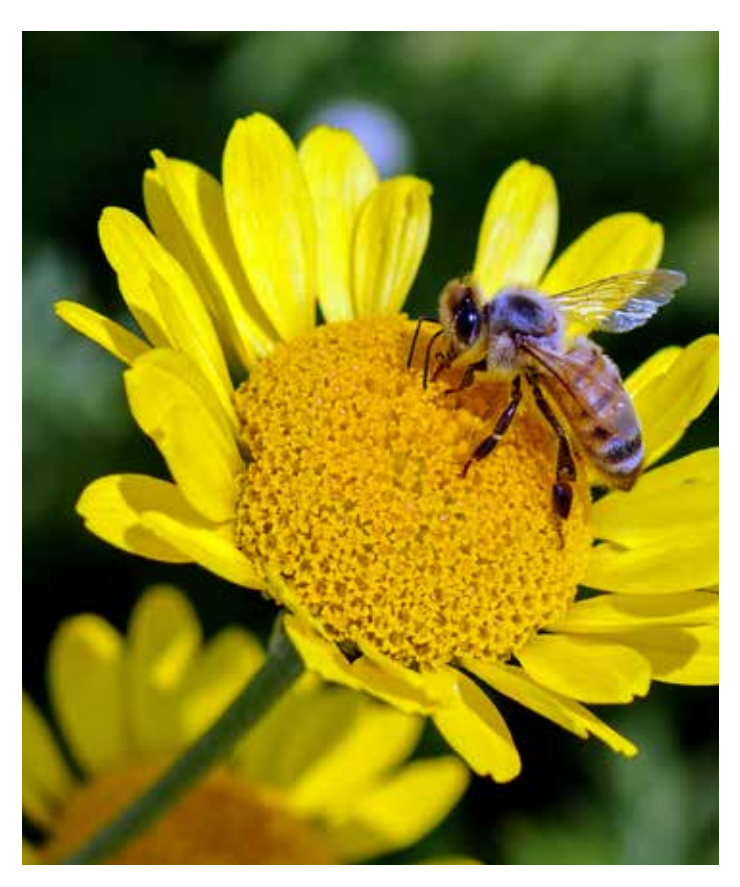
Bee Downtown.