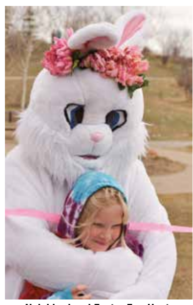
Neighborhood Easter Egg Hunt.

Volunteers are always important to RRROCA, so if you have a few hours of spare time in a month and are interested to help for the community you are living, why not consider volunteering for RRROCA? There is flexibility in time to volunteer for RRROCA and board meeting is always close to home. You will also learn new skills, gain valuable volunteer experience and meet more neighbours. Please email volunteer@rrroca.org