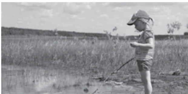
Summer nature adventure day camps Calgary.ca/ParksGuide