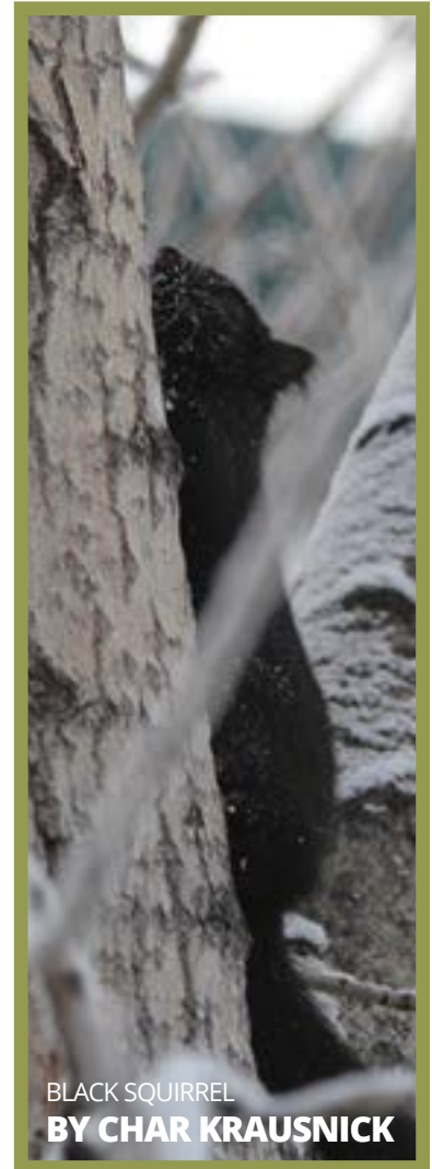
BLACK SQUIRREL BY CHAR KRAUSNICK

The REPORTER wants to showcase the talents of our local photographers throughout the year, both as our monthly cover feature as well as in the newsletter. Think seasonal: send us your Stampede photos for July, or your street decked out for December for example. Think local: capture our community in a great light, our natural environment or just something unique that you've seen when you're out and about. Amateur and professional photographers of all ages are welcome to submit. We cannot provide monetary payment but we will give you a photo credit using your personal name (not your business name, if you have one). Please send your photos as high quality JPEGs to newsletter@rrroca.org and who knows, you just might see your photo(s) in print!