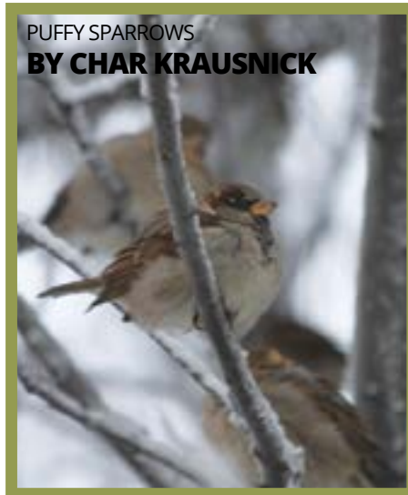
PUFFY SPARROWS BY CHAR KRAUSNICK

The REPORTER wants to showcase the talents of our local photographers throughout the year, both as our monthly cover feature as well as in the newsletter. Think seasonal: send us your Stampede photos for July, or your street decked out for December for example. Think local: capture our community in a great light, our natural environment or just something unique that you've seen when you're out and about. Amateur and professional photographers of all ages are welcome to submit. We cannot provide monetary payment but we will give you a photo credit using your personal name (not your business name, if you have one). Please send your photos as high quality JPEGs to newsletter@rrroca.org and who knows, you just might see your photo(s) in print!