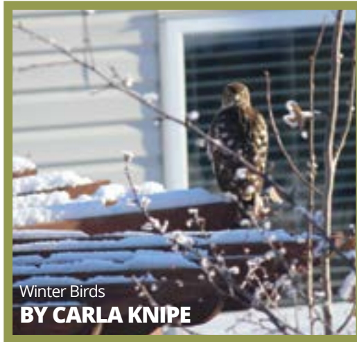
Winter Birds BY CARLA KNIPE