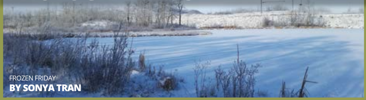
FROZEN FRIDAY BY SONYA TRAN

See below to find out how your pictures can be featured in the RRROCA Reporter