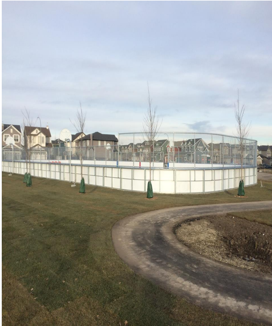
Exterior View of Ice Rink with Fence