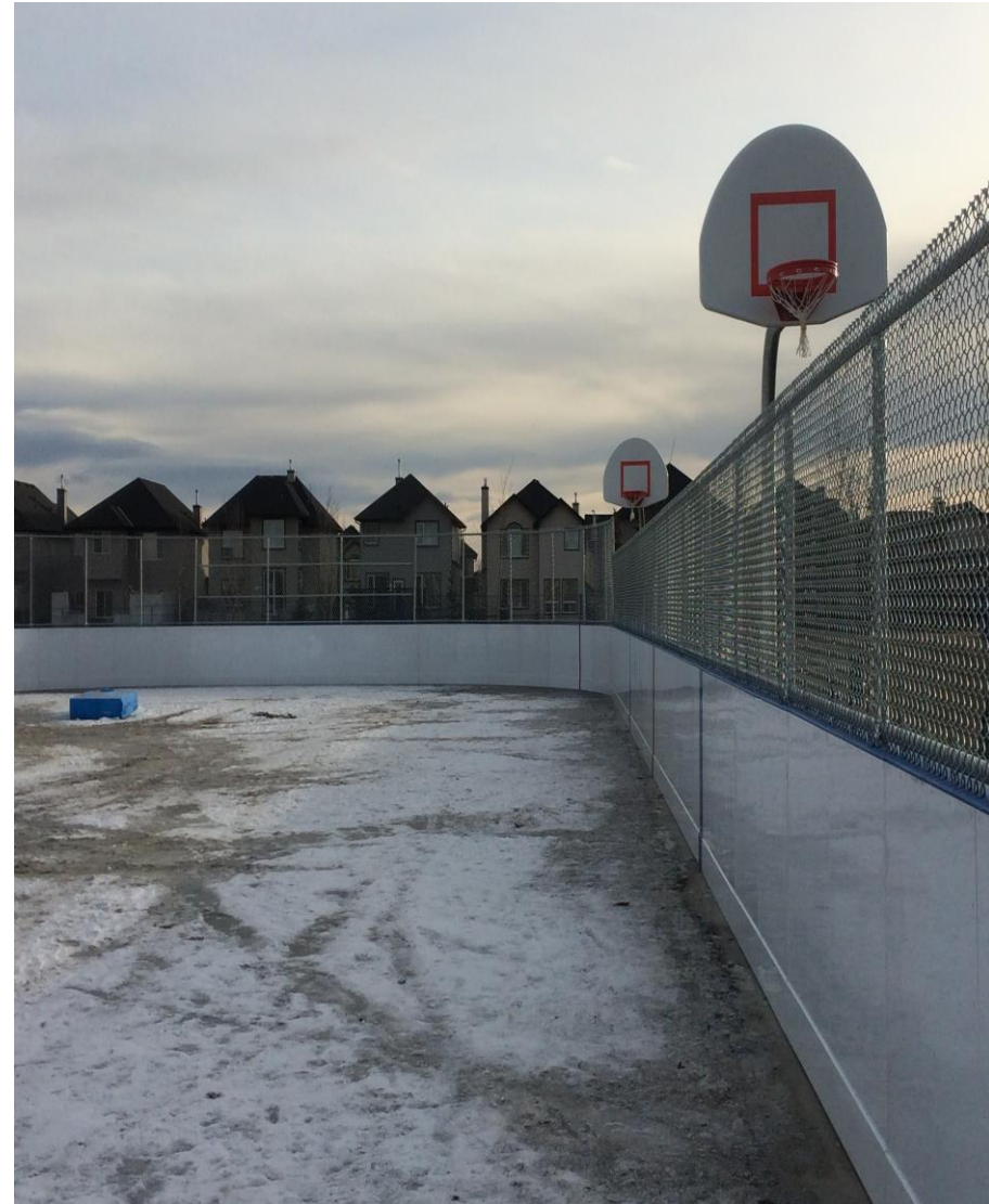
Interior of Rink, Perimeter Fence & Basket Ball Hoop