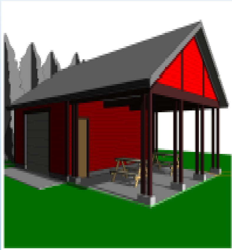
Picnic Shelter & Storage Shed (3D Architectural Representation)