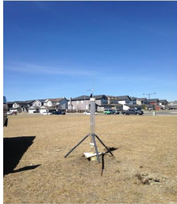
Photo 2. View of Permeameter testing at subject site.