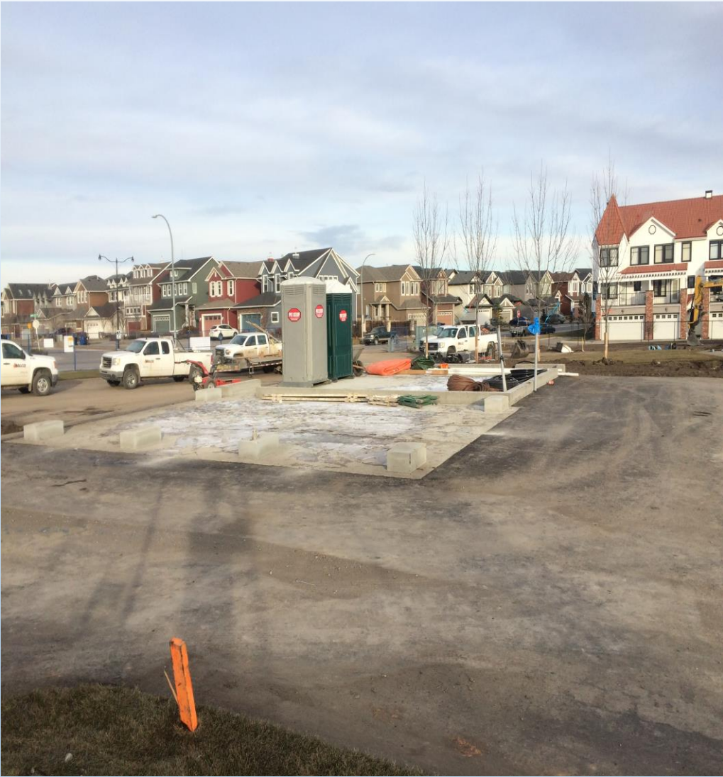
Building Foundation: Complete