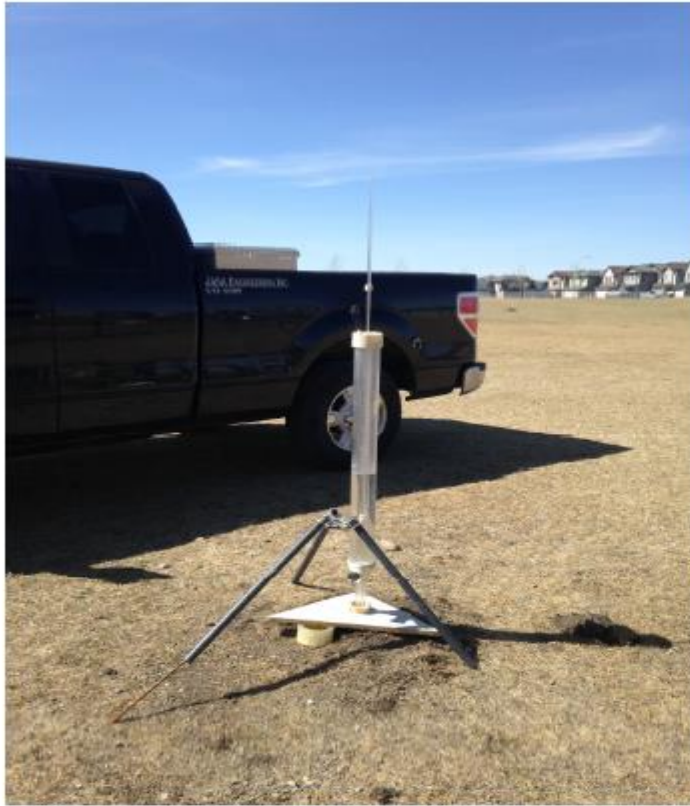
Photo 1. View of Permeameter testing at subject site.